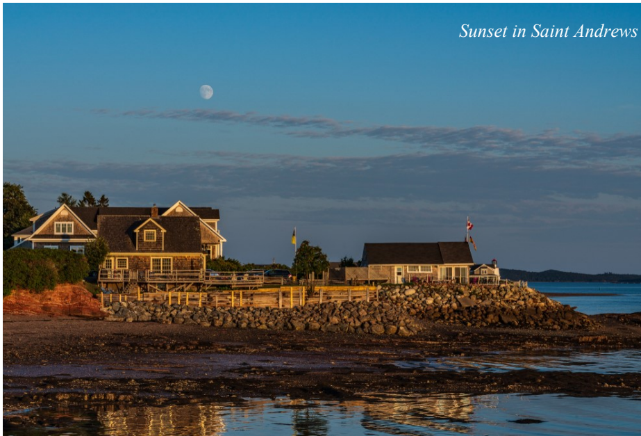
Sunset in Saint Andrews