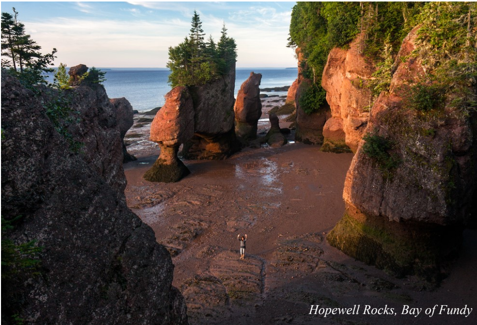
Hopewell Rocks, Bay of Fundy